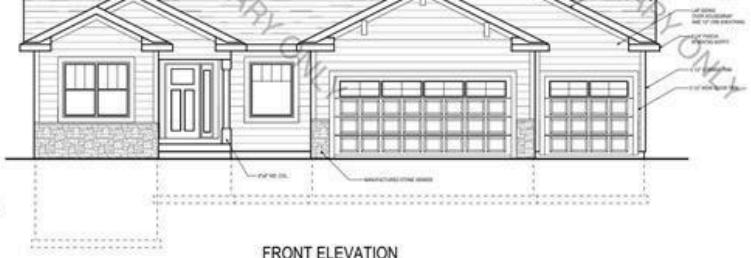
FRONT ELEVATION 1/4" = 1'-0"

ALL DIMENSIONS SHOWN ARE TO FACE UNLESS OTHERWISE NOTED. ALL DIMENSIONS SHOWN ARE TO FACE UNLESS OTHERWISE NOTED. ALL DIMENSIONS SHOWN ARE TO FACE UNLESS OTHERWISE NOTED. ALL DIMENSIONS SHOWN ARE TO FACE UNLESS OTHERWISE NOTED.