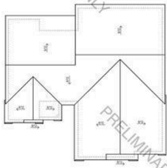
ROOF PLAN 1/8" = 1'-0"

ALL DIMENSIONS SHOWN ARE TO FACE UNLESS OTHERWISE NOTED. ALL DIMENSIONS SHOWN ARE TO FACE UNLESS OTHERWISE NOTED. ALL DIMENSIONS SHOWN ARE TO FACE UNLESS OTHERWISE NOTED. ALL DIMENSIONS SHOWN ARE TO FACE UNLESS OTHERWISE NOTED.