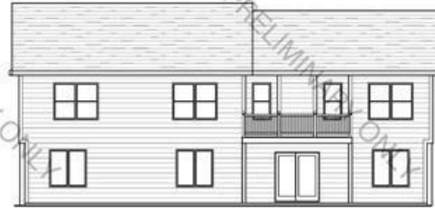
REAR ELEVATION 3/16" = 1'-0"

CONSTRUCTION NOTES: 1. DESIGN SHALL BE IN ACCORDANCE WITH I.C. AND TYPICAL BUILDING 2. FINISHES TO BE DETERMINED BY THE ARCHITECT. 3. ALL DIMENSIONS SHALL BE TO FACE UNLESS OTHERWISE NOTED. 4. ALL DIMENSIONS SHALL BE TO FACE UNLESS OTHERWISE NOTED. 5. ALL DIMENSIONS SHALL BE TO FACE UNLESS OTHERWISE NOTED. 6. ALL DIMENSIONS SHALL BE TO FACE UNLESS OTHERWISE NOTED. 7. ALL DIMENSIONS SHALL BE TO FACE UNLESS OTHERWISE NOTED. 8. ALL DIMENSIONS SHALL BE TO FACE UNLESS OTHERWISE NOTED. 9. ALL DIMENSIONS SHALL BE TO FACE UNLESS OTHERWISE NOTED. 10. ALL DIMENSIONS SHALL BE TO FACE UNLESS OTHERWISE NOTED.