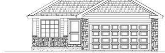
FRONT ELEVATION 1/4 = 1-0