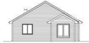
REAR ELEVATION 1/8 = 1-0