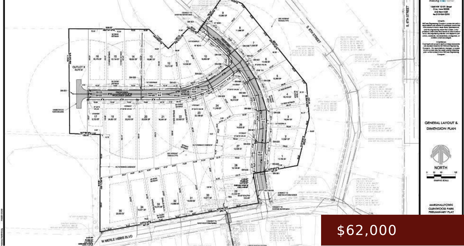
GENERAL LAYOUT & DIMENSION PLAN